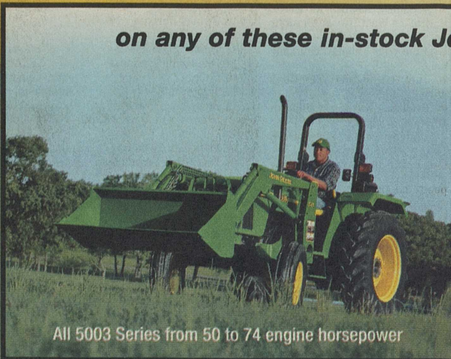
All 5003 Series from 50 to 74 engine horsepower

on any of these in-stock John Deere tractor models